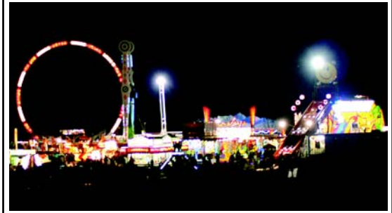
Blairsville Kiwanis Fair at night